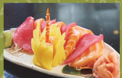
Sashimi (8 pcs)