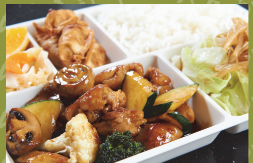
Chicken Teriyaki with Fried Gyoza

Fried Seafood Mix (3 pcs) Egg Roll (2 pcs) Fried Gyoza (4 pcs) Fried Shumai (4 pcs) Fried Shrimp & Scallop (1 pc of each) California Maki (6 pcs) Fried Fish (1 pc) Fried Croquette (1 pc)