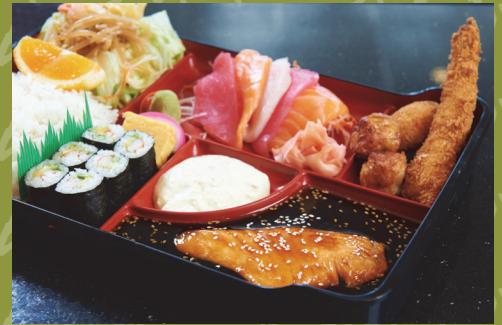
Special Chiba Bento