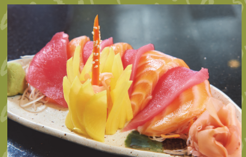
Sashimi (8 pcs)