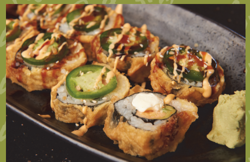
Las Vegas Roll