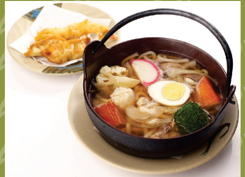
Chiba Stamina Noodles

(baked salmon wrapped around imitation crab, octopus, & rice)