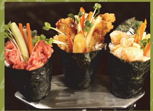
Spicy Tuna, Shrimp, Tempura, Scallop