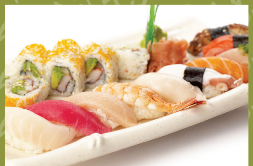
Nigiri (10 pcs)

Nigiri (10 pcs) special california roll (8 pcs) $17.95