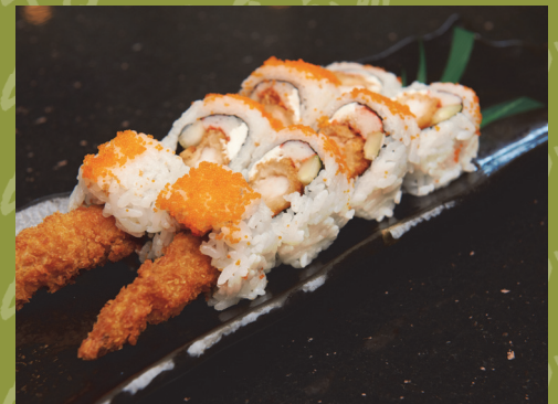
Fried Shrimp Roll