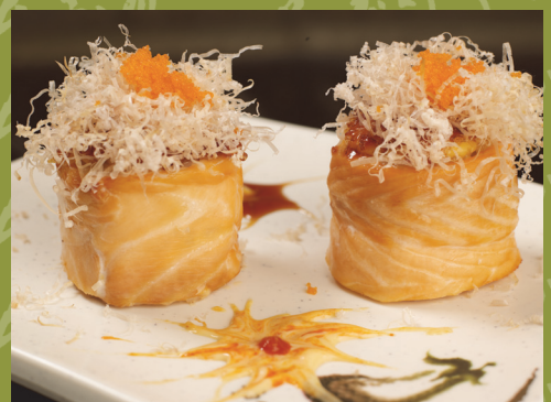
Volcano (2 pcs)